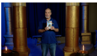
Gospel Shared During Every Episode