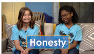
Character Education Through the Lens of Scripture

The KiDs Beach Club® weekly TV show is now airing in all 50 states and 6 of the 7 continents around the world . It is available to more than 500 million homes globally.