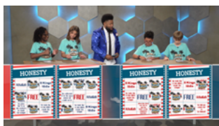
Fun Review Games to Remember the Lesson

You won't find another children's show like this one!